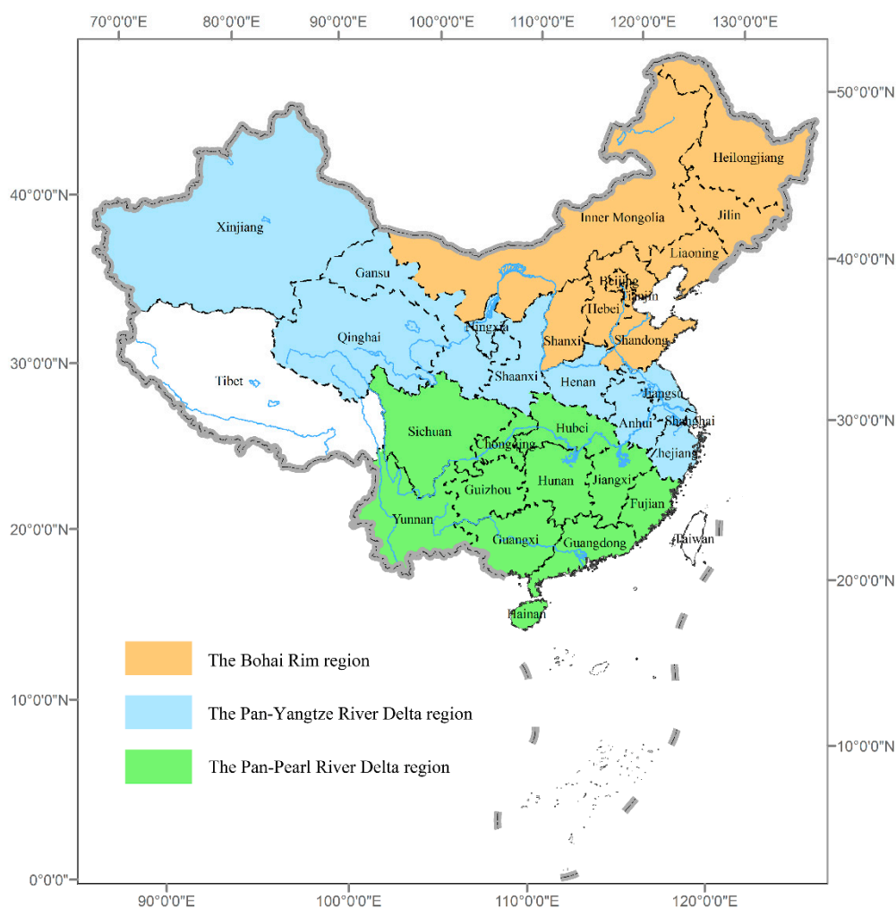
Figure 2. The division of three major economic regions in China.